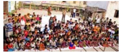
On the last day of the first term, the students of Class One surprised the entire JAAGO school with a drama and dance program that they organized themselves. The program ended with a massive dance with not only the students but the volunteers, teachers and employees as well. Thank to all the students of Class one for organized such a wonderful event for us.